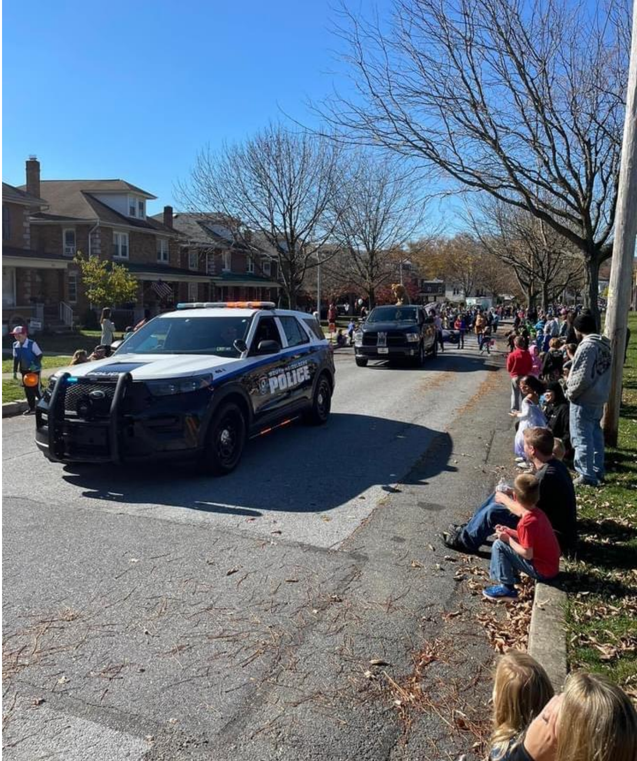
Officers help escort the Wernersville Halloween Parade sponsored by the Wernersville Lions Club